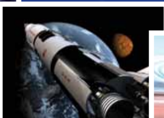
Spaceship – Global cooperation