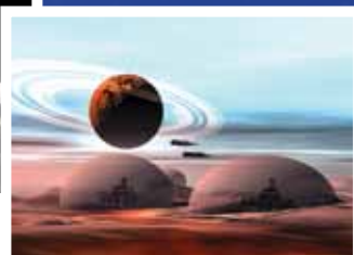
Co-evolution of life